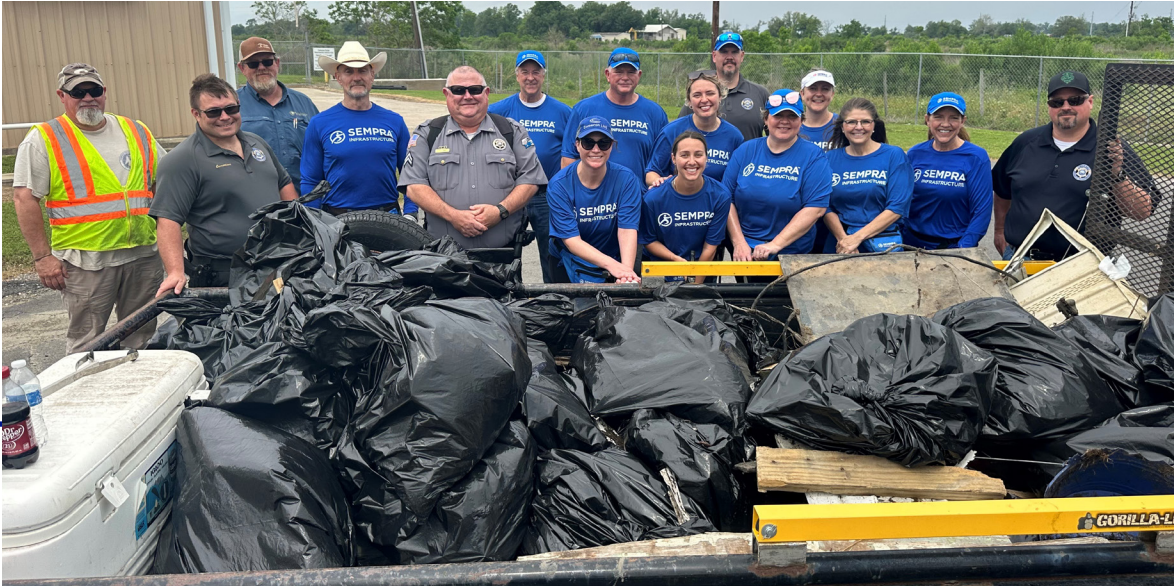
Sempra Infrastructure organized two environmental clean-up efforts in Cameron Parish, including the second annual Trash Bash during Earth Month, where volunteers collected 100 bags of debris and litter from a 3-mile stretch along Main Street in Hackberry, Louisiana. Joined by Cameron LNG employees and residents, these efforts demonstrate our commitment to preserving the environment and making our community a better place to live.