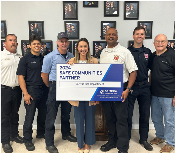
Sempra Infrastructure supports services that focus on making communities safe and resilient. Through the Safe Communities initiative, we awarded funds to emergency response agencies to purchase a thermal imaging camera drone, two AEDs, a life-saving battery-powered extrication tool and a first responder radio.