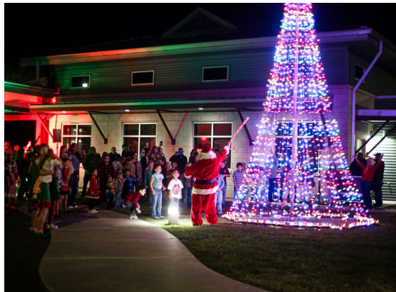
The Hackberry Holiday Festival, sponsored by Sempra Infrastructure, has grown into a cherished local tradition. The first holiday event was hosted in 2004, just before construction of Cameron LNG commenced. This year, nearly 400 community members cheered on the arrival of Santa Claus on a fire truck, took part in face-painting, ornament decorating and the ceremonial lighting of the tree. In addition, approximately $1,000 was raised for the Hackberry Angel Tree project to benefit local families.