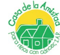
Casa de la Amistad para Niños con Cáncer, I.A.P. (CDLA)