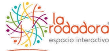
Espacio Interactivo La Rodadora, A.C.