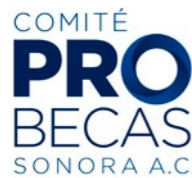
Comité Pro Becas Sonora, A.C.