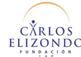
Fundación Carlos Elizondo Macías, I.A.P.