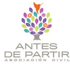
Antes de Partir, A.C.